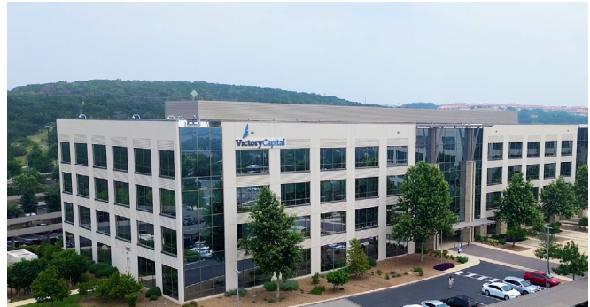
FILE NAME: HEADQUARTERS 1