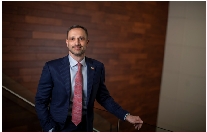
FILE NAME: CEO 2