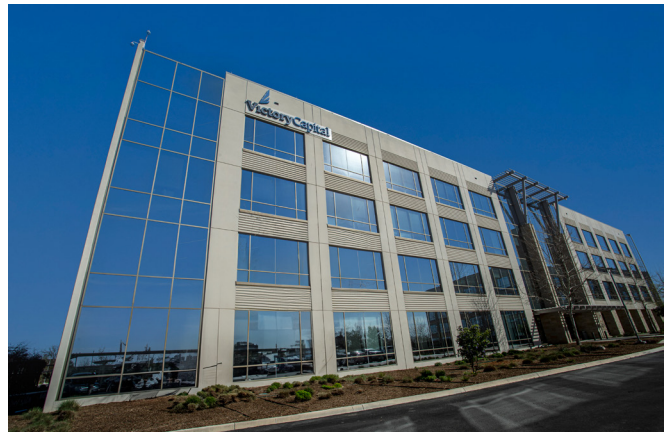
FILE NAME: HEADQUARTERS 2