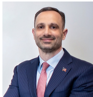
FILE NAME: CEO 3