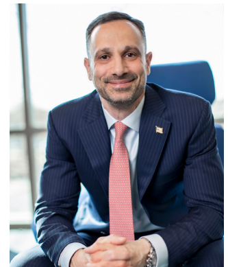
FILE NAME: CEO 4