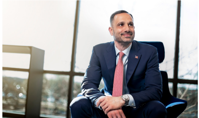
FILE NAME: CEO 1